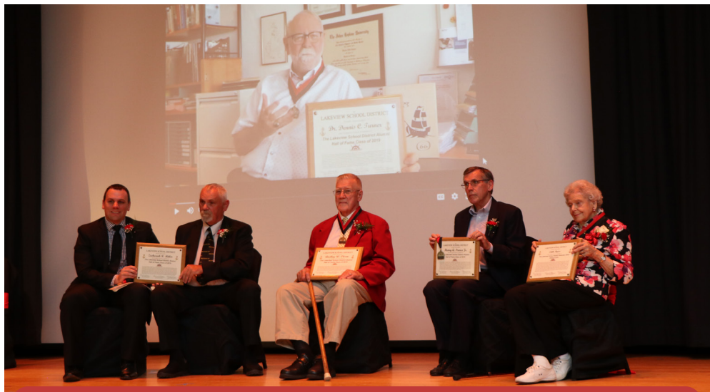
Lakeview Alumni Hall of Fame Class of 2019-2020