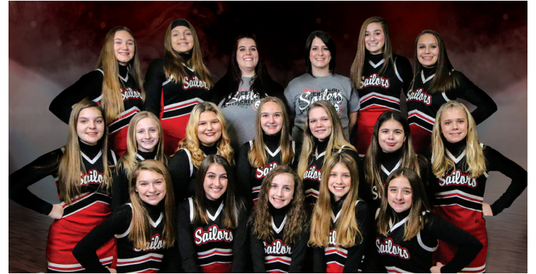
Jr. High Cheerleading