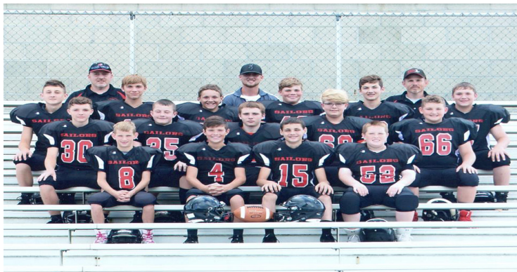
Junior High Football