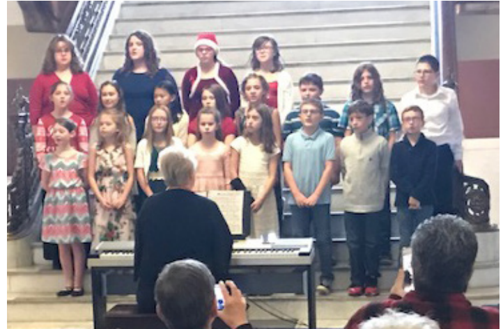
5th Grade Select Choir