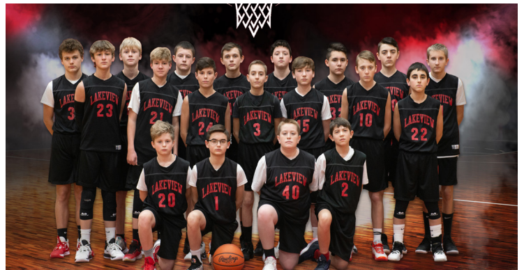
Jr. High Basketball